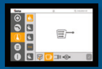
OptiControl powder management control