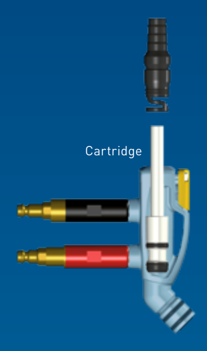
Plug & Convey

The "Plug & Convey" mechanism ensures quick colour change and cleaning by removing the powder hose and cartridge in one easy step.