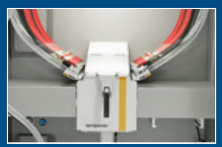
OptiSpeeder powder hopper