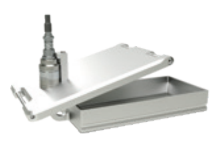
Ultrasonic sieve insert US07