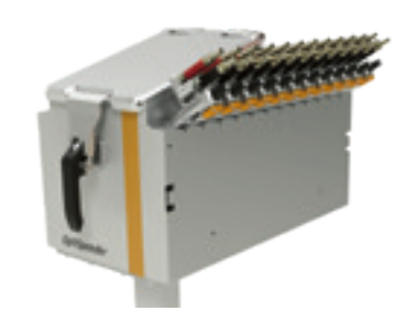
OptiSpeeder with OptiFlow injectors

The switching from fresh powder to recovery operation and cleaning mode is fully automatic.